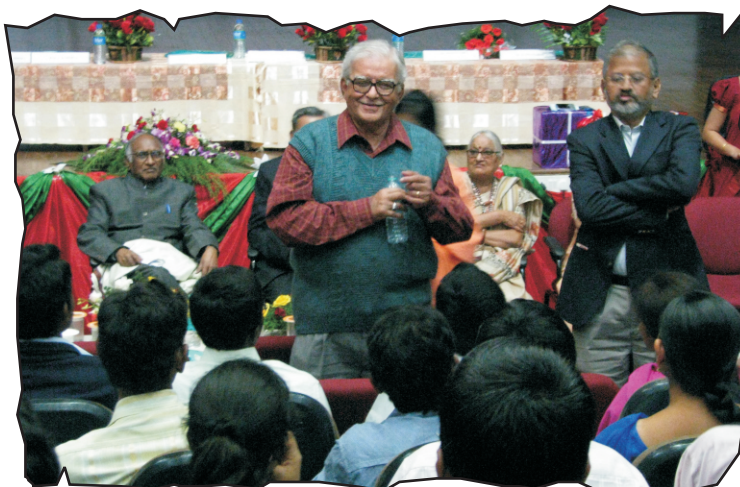
Dr. J.J. Irani, Chairman, Council on Affirmative Action, CII interacting with scholars

L earning from the last nine years' experience, FAEA believes it is imperative to provide soft skills training (communication skills, team building, problem-solving etc.) aimed at leadership development. The aim of providing Scholarship supplemented with skill development program is to create socially responsible leaders who would occupy mantles of leadership in society and contribute to the betterment of the nation. So, to make their education relevant to changing times, a number of training programs were planned last year. Two training programs were organized during 26 th December 2009 to 3 rd January 2010 and November 11 th 2010 to November 20 th 2010 at Bangalore. FAEA hopes the learning journey planned for these students will break the shackles of limits and engage the young adults with options, abundance and possibilities.